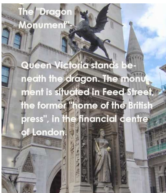
The "Dragon Monument"

responsibility for the crimes committed in the name of British Imperialism.