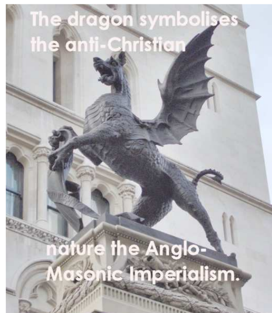
The dragon symbolises the anti-Christian

Queen Victoria stands beneath the dragon. The monument is situated in Fleet Street, the former "home of the British press", in the financial centre of London.