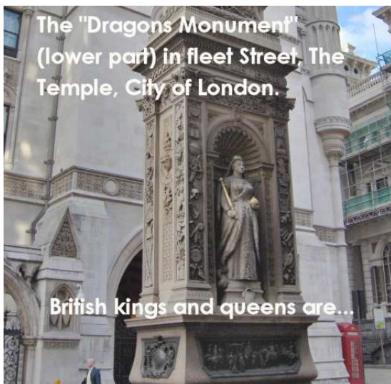
The "Dragon Monument" (lower part) in fleet Street, The Temple, City of London.